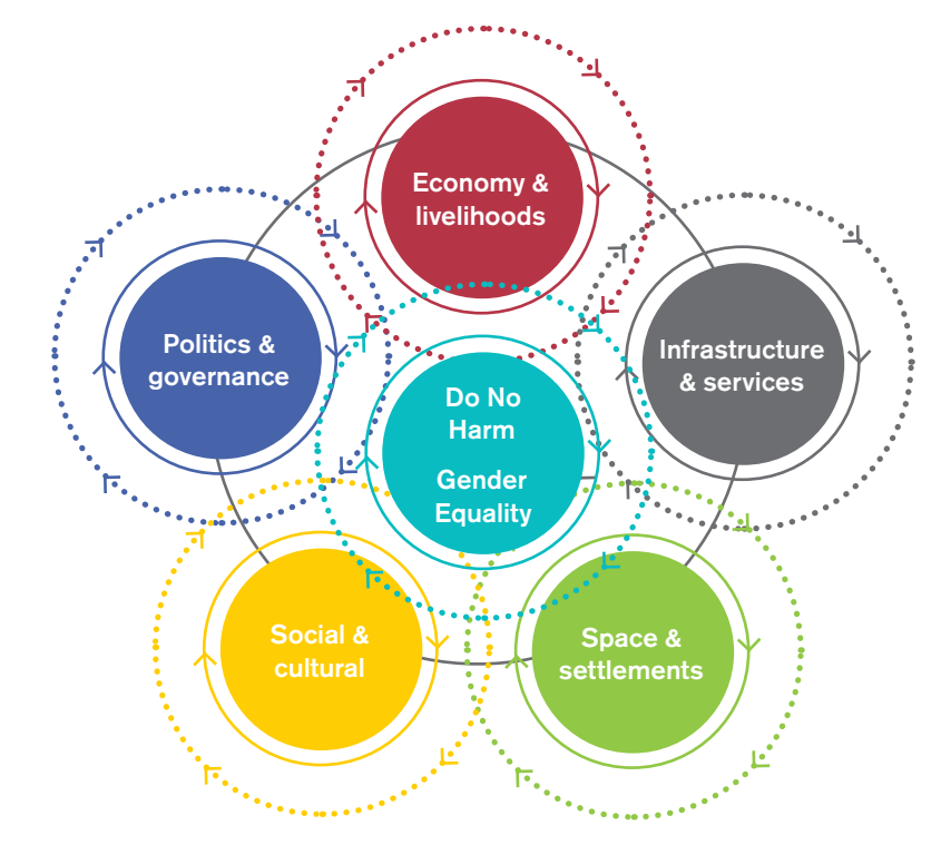
Figure 3: Typology of urban systems